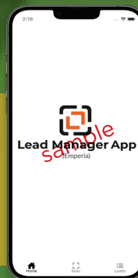
Lead Manager App