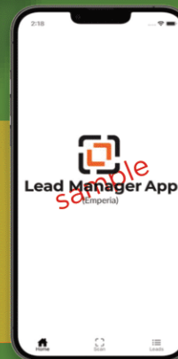
Lead Manager App